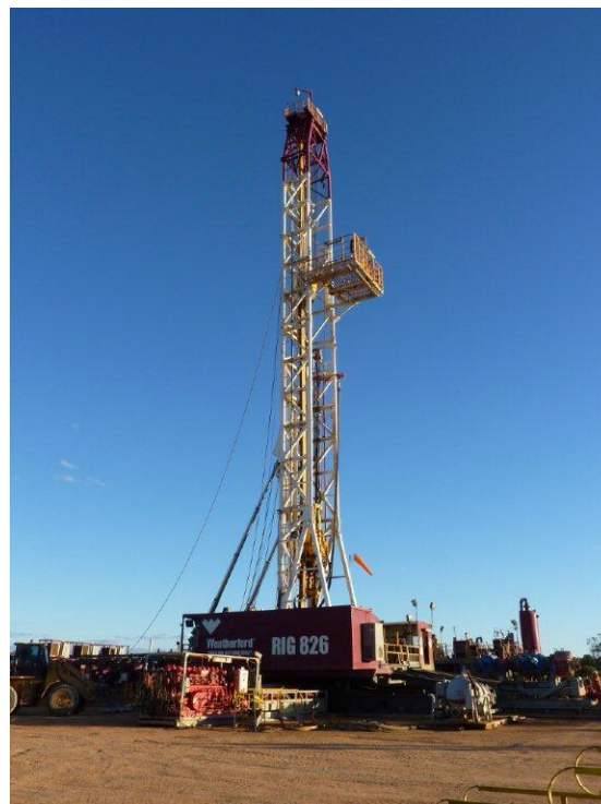
Figure 3. Weatherford Rig 826 on location at Arrowsmith-2